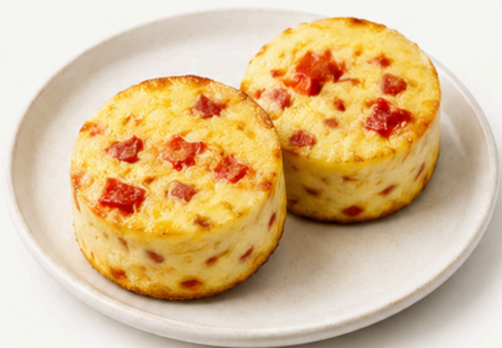
Egg White & Roasted Red Pepper Egg Bites (2 bites) ~170 CAL | 12G PROTEIN