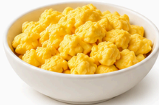
2 Scrambled Eggs + 1 Serving Egg Whites