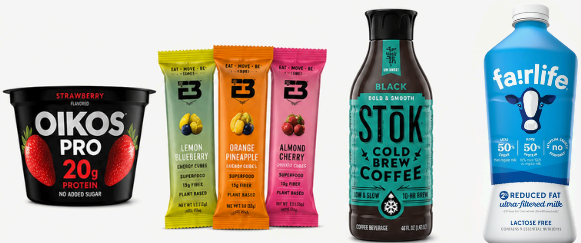
Oikos Pro Single (5.3oz)