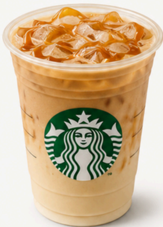
SF Caramel Protein Iced Latte ~200 CAL | 29G PROTEIN