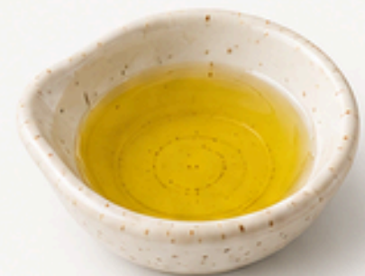
1 tsp Oil ~40 CAL | 0G PROTEIN