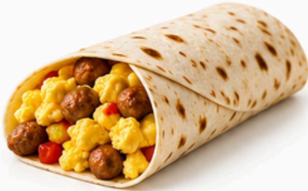
Carb Balance Wrap (Soft Taco)