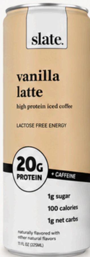
1 Slate Vanilla Latte Protein Coffee ~100 CAL | 20G PROTEIN