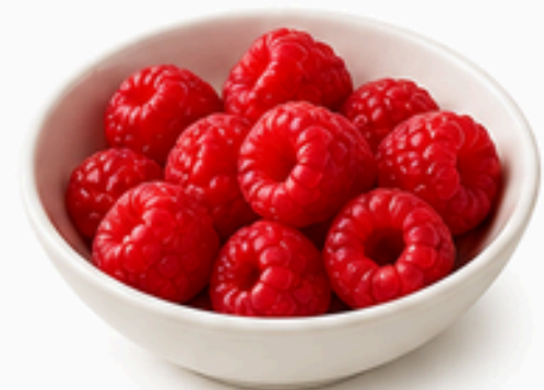
½ Cup Raspberries