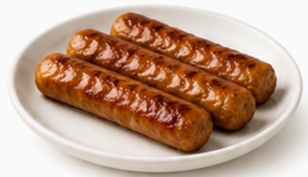
3 Turkey Sausage Links