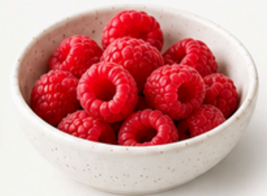
Side of Raspberries (1/2 cup) ~30 CAL | 0.5G PROTEIN | 4G FIBER