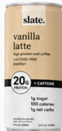
Slate Vanilla Protein Coffee