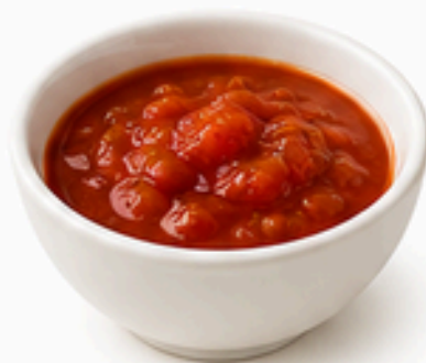
1 Tbsp Salsa