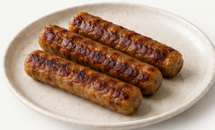
3 Turkey Sausage Links ~130 CAL | 12G PROTEIN