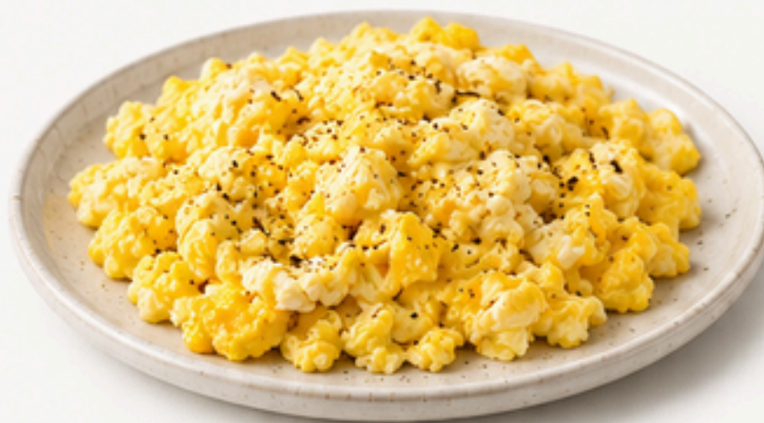
2 Scrambled Eggs + 1 Serving Egg Whites ~165 CAL | 17G PROTEIN